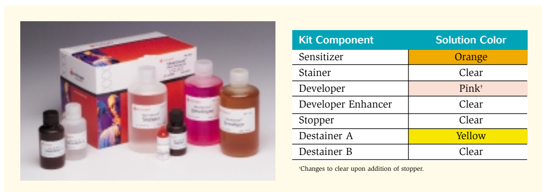
Figure 3 – Color tinted reagents in the SilverQuest™ Kit

of unnecessarily repeating steps or accidentally missing one. With the SilverQuest™ Kit you can be assured of successful staining results without wasting time repeating procedures.