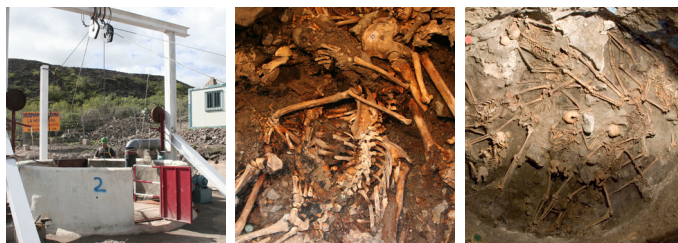
Figure 1. The excavation site "Pozo de las Brujas".

In recent years Spain began the process of recovering the bodies of people who went missing during the Spanish Civil War. This project has been named "Recovery of Historical Memory." The first 24 bodies which were lying in the "Pozo de las Brujas", (Aruca-Gran Canaria) were recovered in December 2008. These remains had been thrown inside a well on March 19, 1937. This well was approximately 50 metres deep and had never produced water (Figure 1).